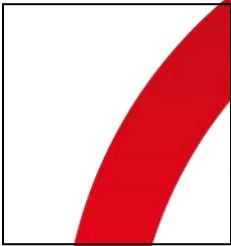
(Your Name) (Applicant)